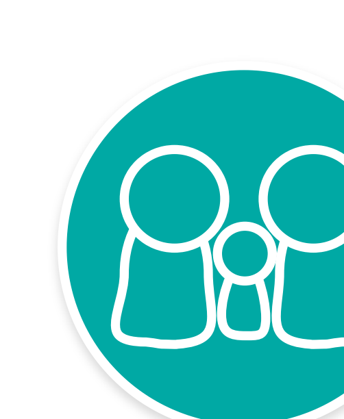
Nurturing Families Program